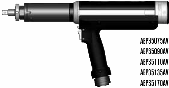
AEP35075AV AEP35090AV AEP35110AV AEP35135AV AEP35170AV