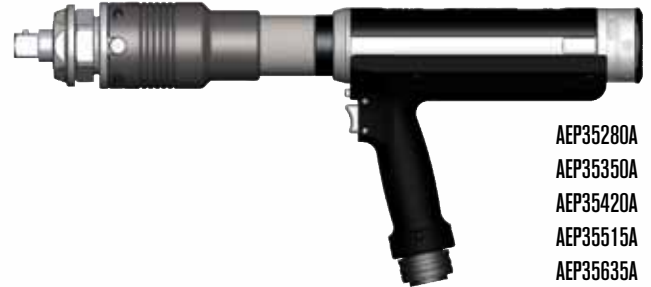
AEP35280A AEP35350A AEP35420A AEP35515A AEP35635A